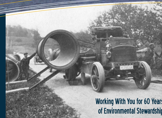
Working With You for 60 Years of Environmental Stewardship

Ronald Wastewater District is an independent, non-taxing, special purpose district and not part of the City of Shoreline. You, the ratepayer, elect your commissioners to set policy for the District and they are aware that many ratepayers are struggling to make ends meet. Now is not the time to add to that burden. Annually the Board reviews the District's sewer charge. It will do so again in October/November 2012.